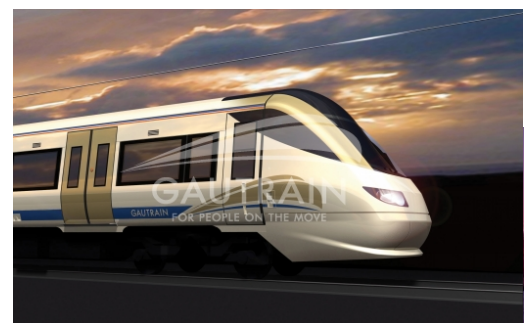
Artist's Impression of Gautrain train

three anchor stations on these two links, seven other stations will be linked by approximately 80 kilometres of rail along the proposed route. JCP is helping with culture change across the project to help it meet its goals in time for the 2010 World Cup.