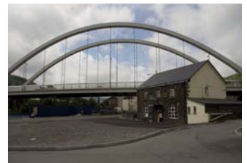
Views of the Rheola bridge—part of the award winning Porth Relief Road project