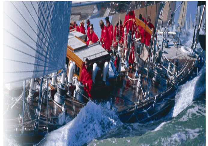
Attendees on a JCPii team building event.

JCP has also begun work with the SEESA top team in terms of a behavioural and objective setting session to help set the desired culture for the alliance right from the top with a committed and role-modelling leadership team .